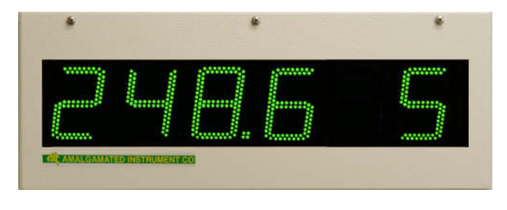
100mm green display version